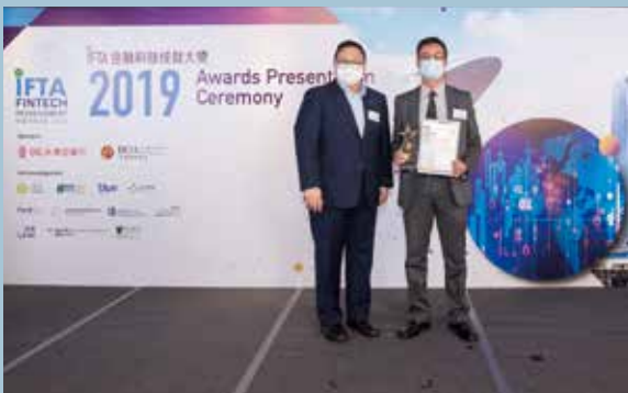
The programme received the Honorary Award - Fintech Education Contribution in the IFTA Fintech Achievement Awards 2019