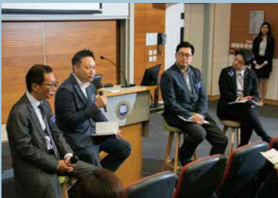
Seminar on GDPR

The University Project launcher of the HKSTP aims to offer practical project-based learning experiences to partnering university students.