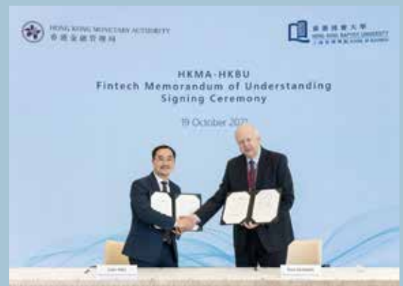
MOU signing ceremony with HKMA

“Cybersecurity and Data Privacy are increasingly becoming board level responsibilities, and the emergence of FinTech and Virtual Assets allows attackers new methods to gain access to valuable assets. With the GDPR in force since May 2018, FinTech companies may have both security and regulatory requirements they are not fully aware of. Through a mix of academic and industry leaders, the Master’s programme recognizes the trends and importance of cybersecurity and privacy and will enable students to gain a deeper awareness of these issues and practical ways to mitigate these risks.”