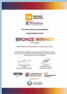
The programme received a Bronze Award at the QS-Wharton Reimagine Education Awards 2022 under the category of Digital Readiness