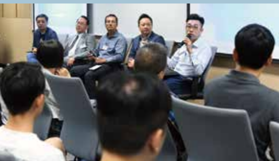
Fintech career sharing