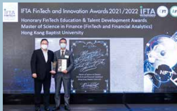
The programme received the Diamond Award of Honorary Fintech Education & Talent Development Award from IFTA Fintech & Innovation Awards 2021/2022